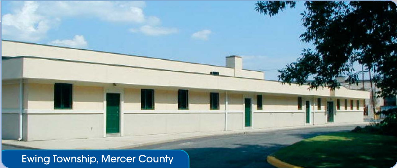
Ewing Township, Mercer County

• 1320 Parkway Avenue is strategically located at the intersection of Scotch Road and Parkway Avenue within one mile of I-95.