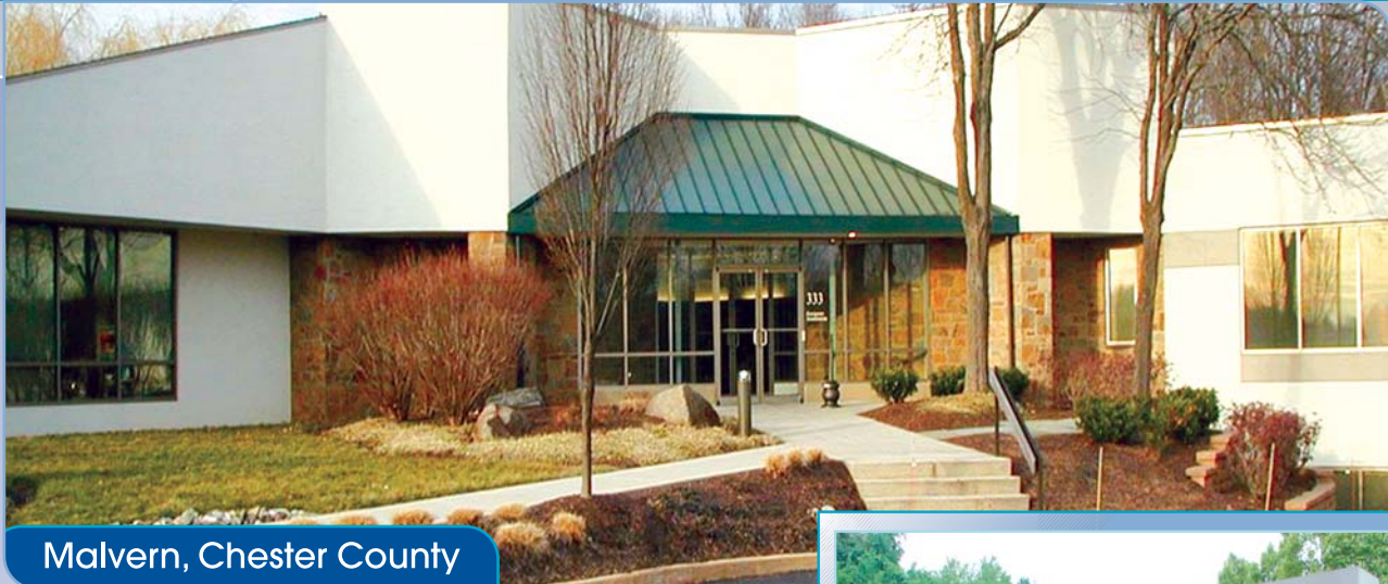
Malvern, Chester County

333 Technology Drive is conveniently located within one mile of Route 29 and within 2 miles of the Malvern exit of the Pennsylvania Turnpike.