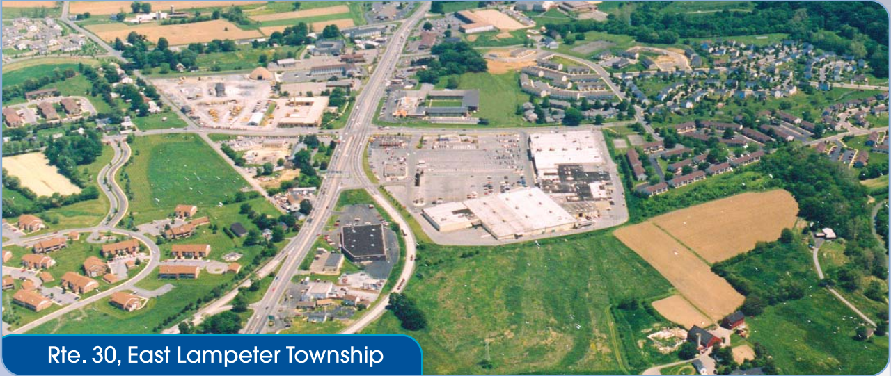
Rte. 30, East Lampeter Township

Located on Rt. 30 at the terminus of the Lancaster By-pass, the East Towne Shopping Center is anchored by a 90,000 S.F. Kmart.