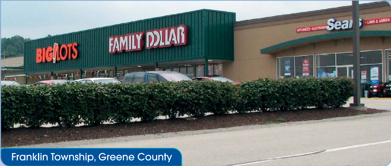
Franklin Township, Greene County