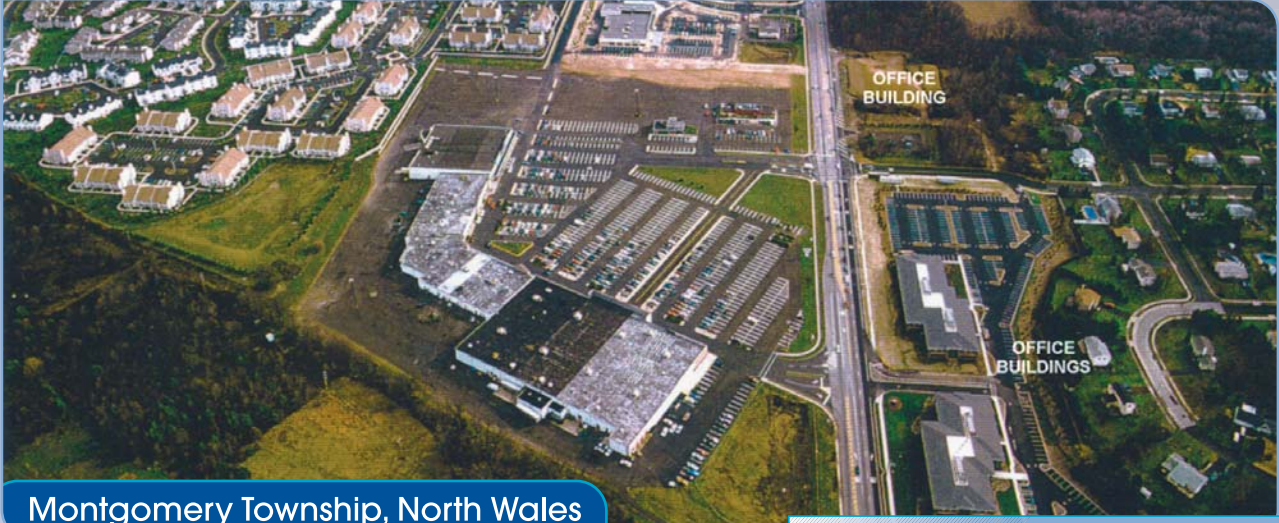
Montgomery Township, North Wales