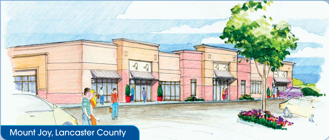
Mount Joy, Lancaster County

Located at the intersection of Route 230 and Cloverleaf Road, the Norlanco Square Shopping Center is slated to break ground in Spring 2008