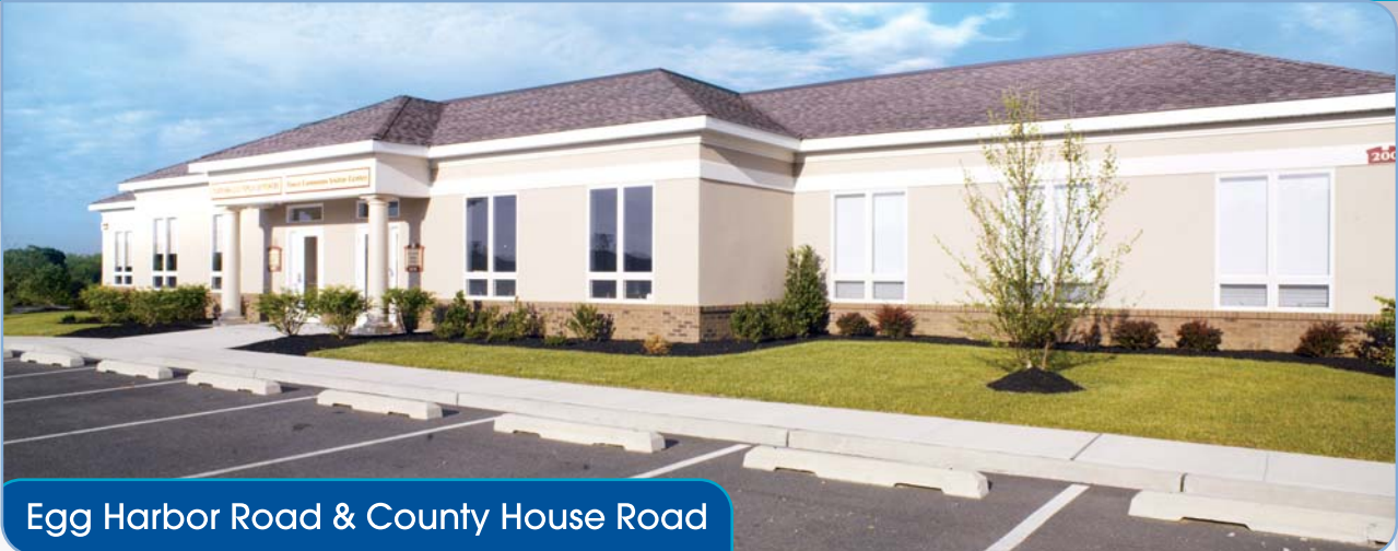
Egg Harbor Road & County House Road

96,000 S.F. of office space for sale/lease